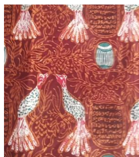
Fig 6. Kuwau Bird Motifs

Serving on this batik ornamental variety will realize the aesthetic value that is hidden from nature. The pattern of two birds with tails hanging down with the pose of sharing food, this displays a beautiful view of life together without any sense of revenge or fighting over food. The two birds perched in the shape of this vast natural peace sign symbolize the prosperity of the Sarolangun region. Rattan flower motif is used as a supporting element of this decoration, the meaning of which is everyone has their own benefits. Sarolangun society which is basically