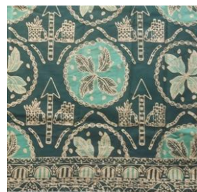
Fig. 3. Motives Behind Oaths

This motif is inspired by the culture of the jungle tribe on the 12 hill of district black water river. The shape of a circular braid behind the oath and the shape of the leaf distorting the shape of the rattan leaf, the shape of the arrow going upwards is the spear of the inner tribe, and the shape of the tube on the two sides of the spear is the continuation of the jungle tribe with the contents of the rattan leaf. The shape of this ornamental pattern consists of a motif structure which is the shape of a spear, the shape of the junction, the shape of the necklace behind the oath, and rattan leaves.