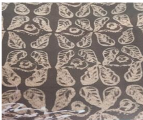
Fig.1 Mato Punai Motif Extinct

Mato Punai motifs taken from the shape of Punai Birds Eyes and forms of henna pigs. Mato Punai Birds have small circular shapes and the curved line is leftward below the leaf. Leaf motifs composed of four is a form of henna leaves. Mato Punai is a sign for farmers to see success in planting tapioca. if many Punai Birds appear, then the sign of the rice harvest is successful. Punks in the arrangement of batik decoration are also applied in abstract form, giving a signal that this bird is giving a positive message to human life.