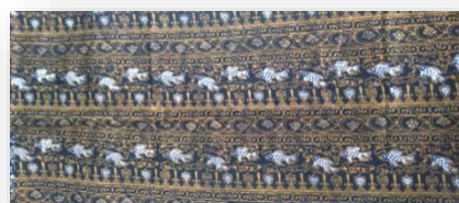
Fig 5. The Edge of The Cik Minah