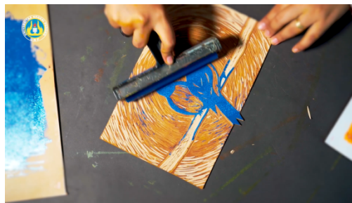
Figure 4. Display of the Steps of Making Works on Learning Video Media

After the video media has been developed and assessed by expert validators, the next step is analyzing the data. In this research and development, the analysis of media validity uses the Aiken's V formula with validity analysis using a Likert Scale. The Validation formula is