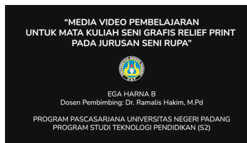
Figure 2. Learning Video Media Cover Page