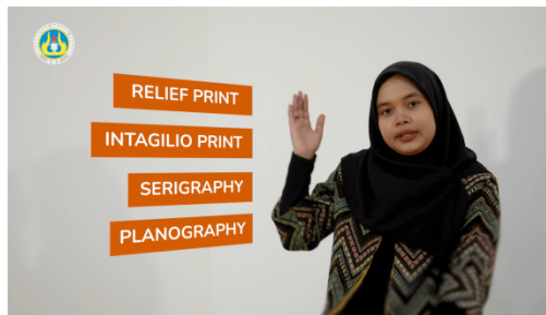
Figure 3. Display of Theory on Learning Video Media